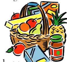
Thanksgiving Food Baskets