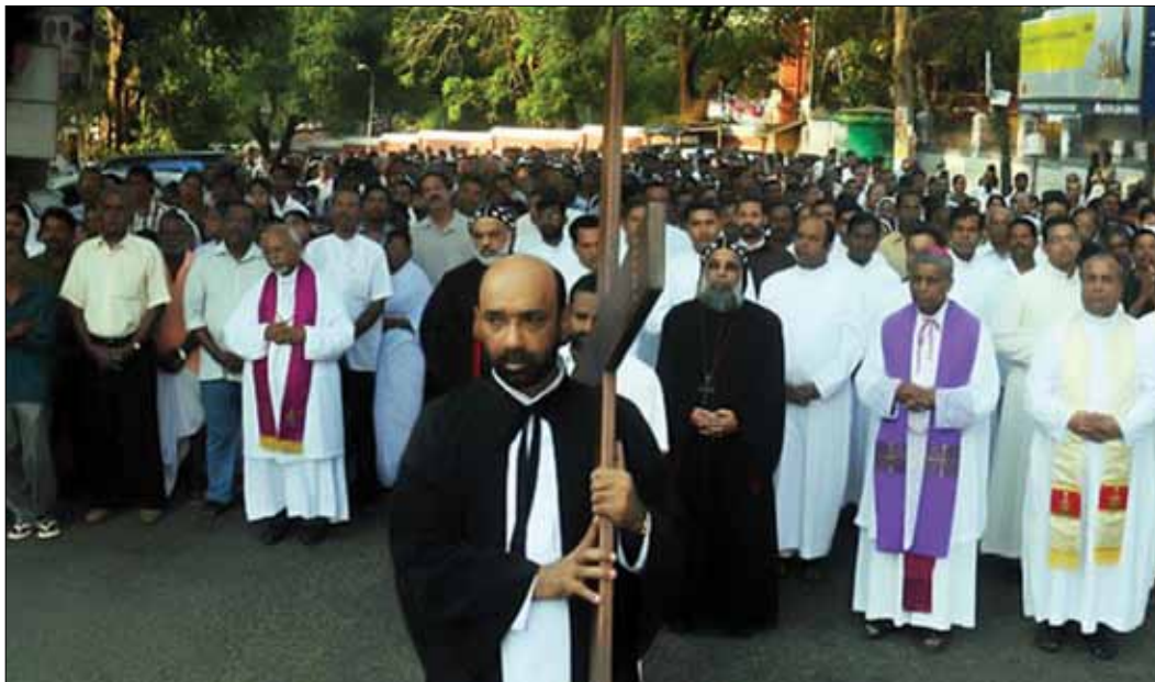
Holy Week Procession

of the Qurbana (Holy Mass) they used to approach the altar, kiss the Statue of Risen Lord and pay respect to the celebrant, bidding farewell.