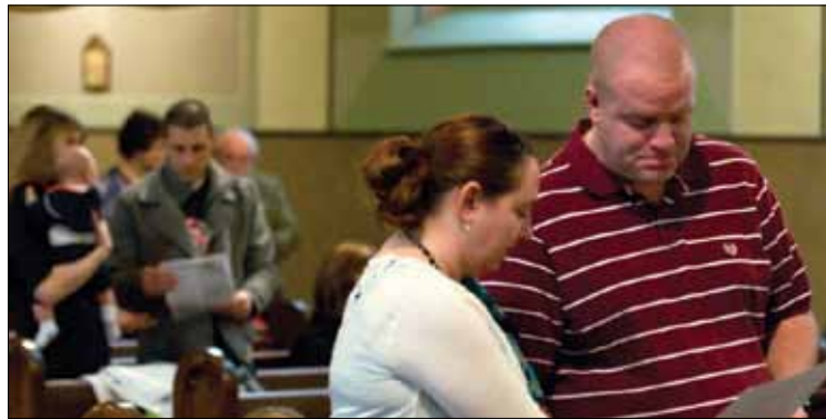
- Renewal of Marriage Vows -