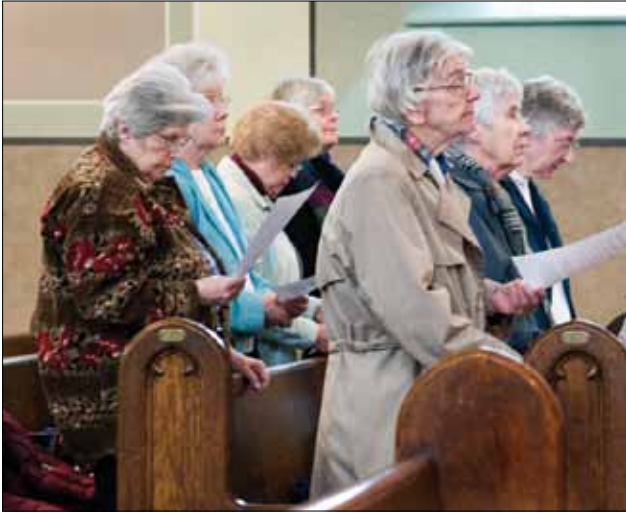
Renewal of Religious Vows