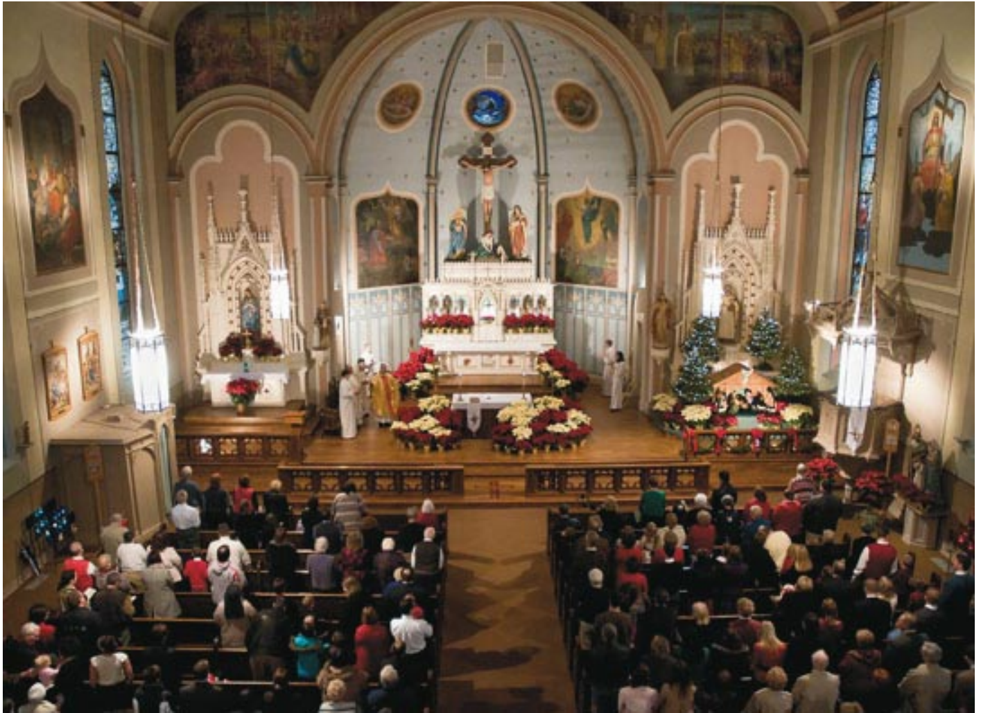
A view of our beautiful church as seen on Christmas Eve 2008.

All is Gift – In all times and seasons, Give Thanks!